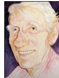
2nd Place ($150) "Carl" by Peg Cullen